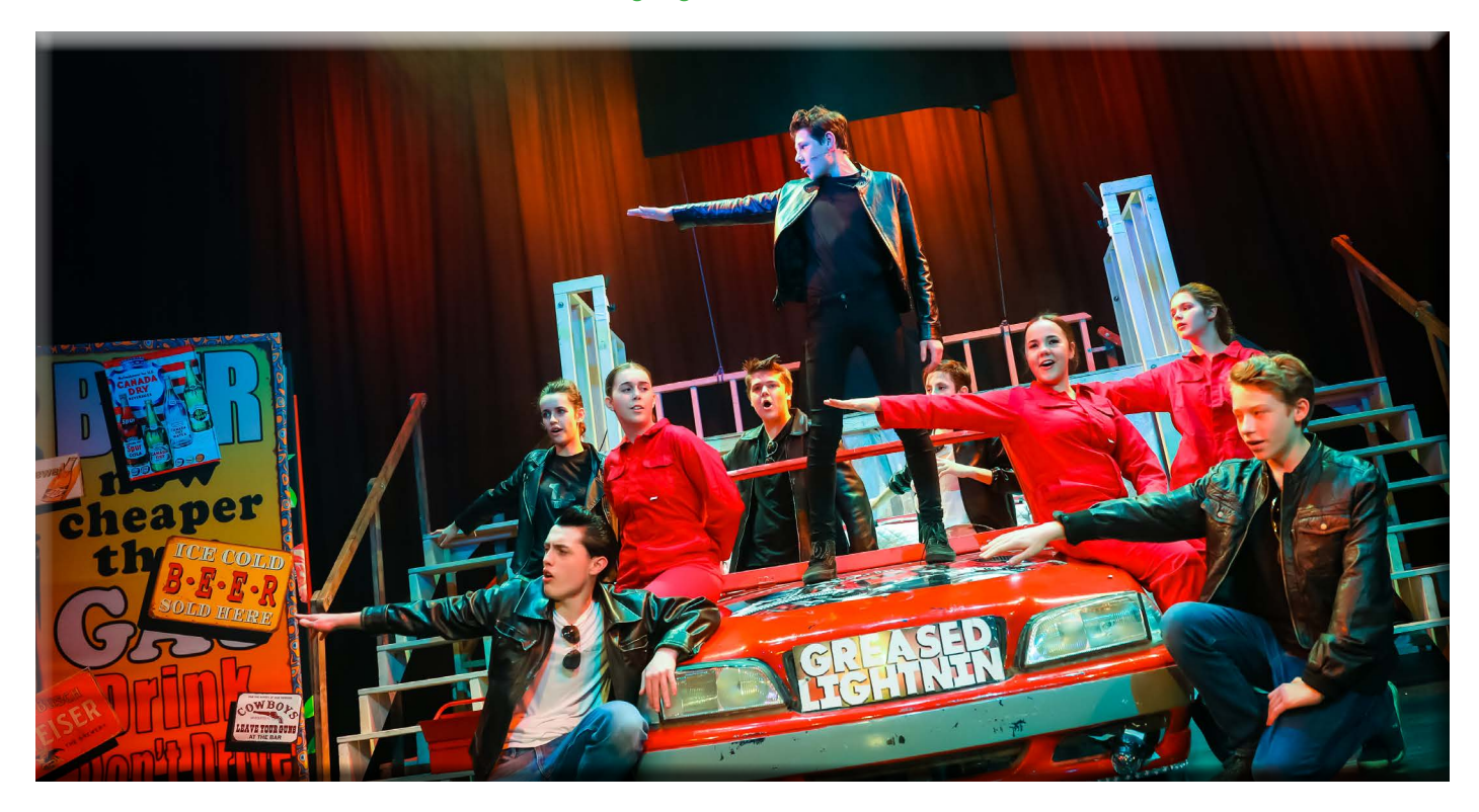
Performing Arts Centre and Conference Centre