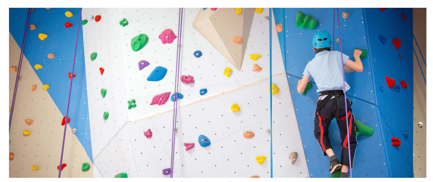
Superb Sports Facilities