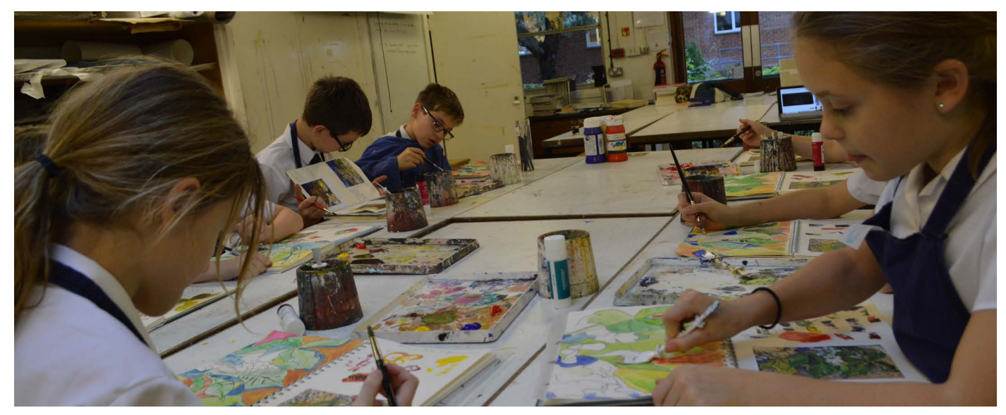
Well-equipped Art Studios