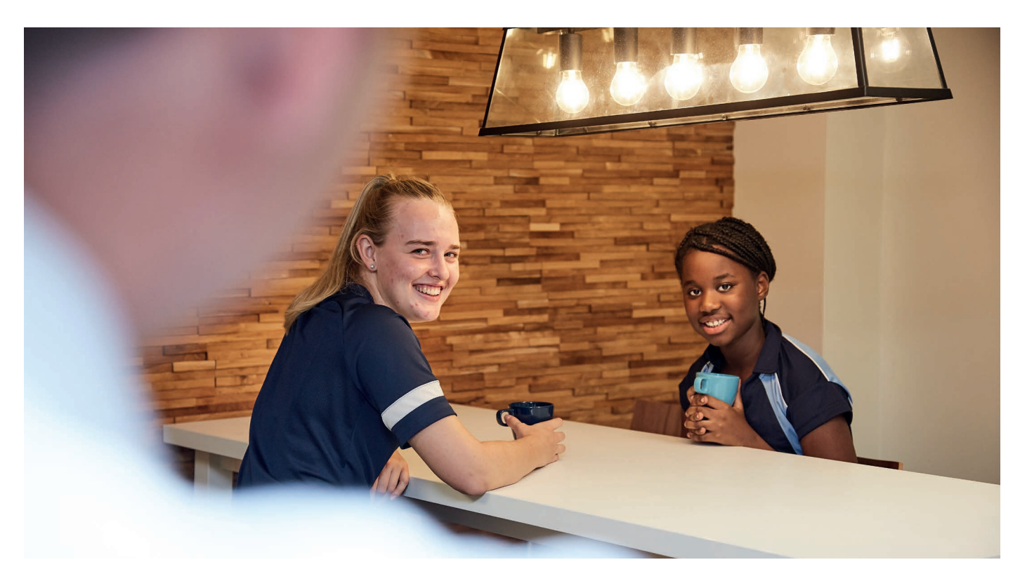
Boarders' Common Rooms

The boarders have use of spacious, modern common rooms, complete with comfy sofas and large screen TVs. The well-equipped kitchen areas are popular for making snacks and drinks and even some home-baking! The bathrooms are clean and bright and equipped with both baths and showers. Other facilities include the use of washing machines in-house, as well as the school laundry facilities.