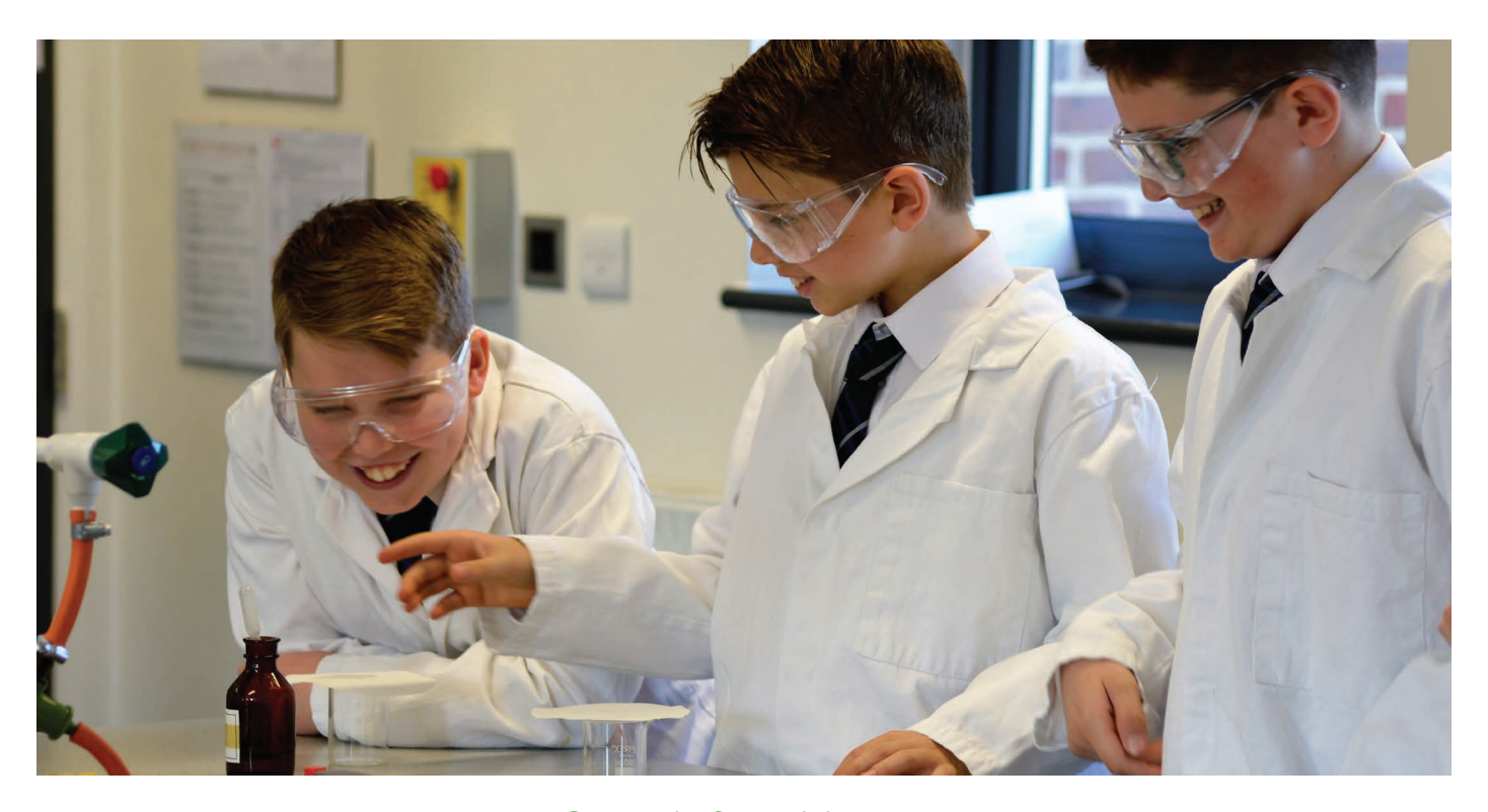
Cutting-edge Science Laboratories

Luckley boasts superb facilities, including modern classrooms and laboratories, a state of the art music centre, professional performing arts and conference theatre, spacious art studios, a large sports centre with an all weather pitch, a fitness suite, trampoline and a climbing wall. Additionally, students have access to many of these facilities outside of the school day for extra-curricular activities.