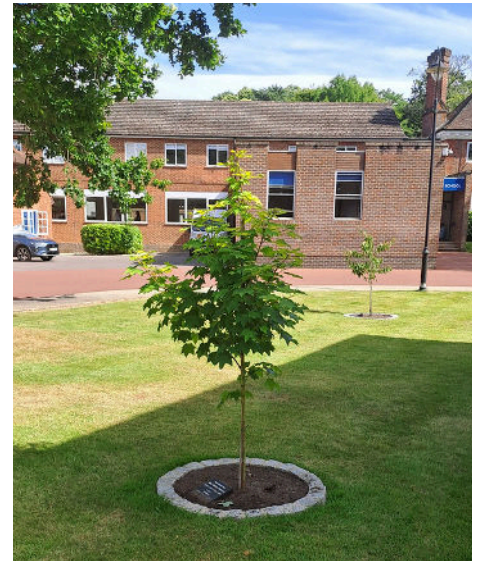
The Ash tree purchased and planted in memory of Miss Valerie Pornicott, several months after it was planted.