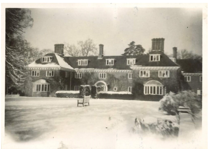
1946 Luckley School during winter

Much of Luckley's development has been made possible by the extraordinary generosity of its benefactors together with the sale of school grounds. The introduction of formal legacy giving was introduced several years ago and we have been fortunate to receive financial gifts from three alumni to-date. Our hope is that legacy giving will play a part in supporting Luckley's future plans and allow this wonderful community to continue its mission years into the future. Find out more about Luckley Society 1918 by clicking here where Luckley introduces legacy giving, providing an opportunity to those that may wish to give back to the School in their will.