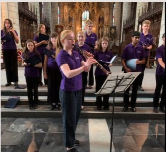
Brussels Cathedral, final Luckley performance on tour