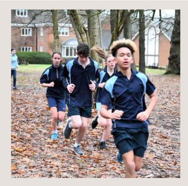
Interhouse cross country race, 2022