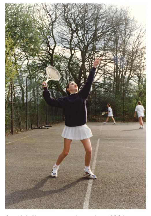
Cornish House, sport in action, 1991