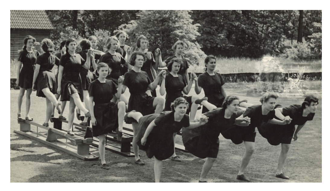
Gym display, 1942

With our up-and-coming Alumni Games in March I thought I would dig out sport at Luckley photographed over the years. If you have any information on who is featured and exactly when the photograph was taken, please do get in touch.