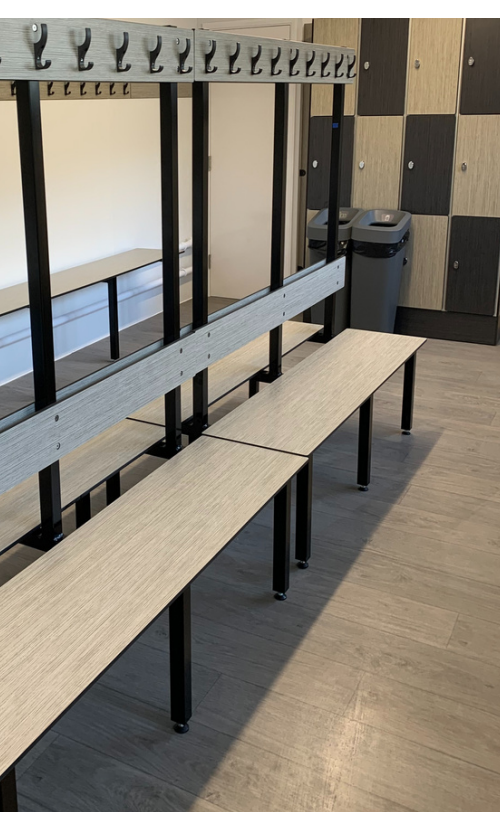
(Above) Newly refurbished girls' changing rooms (Left) Girls' changing room walls in the shower room before refurbishment

To find out what is on visit: https://www.luckleyhouseschool.org/th e-whitty-theatre/whats-on/.