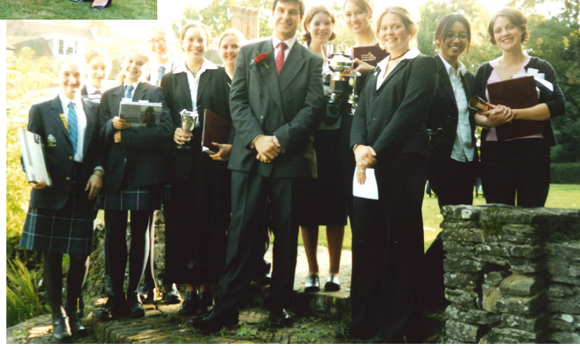
Speech Day 2001