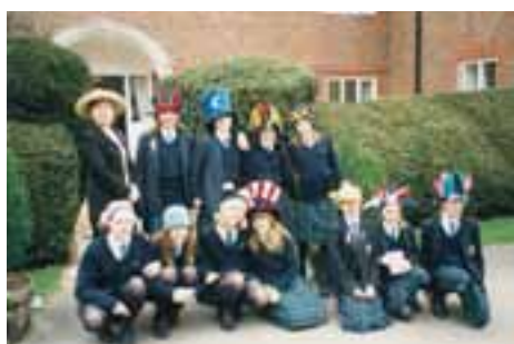
The Mad Hatters.