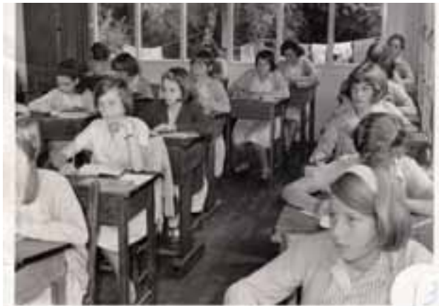
This appears to be in Woodlands - 1950-60. (I particularly like the washing hanging outside!)

Can you help with the archives? If you recognise yourself or any of your friends in the photographs please let me know names and dates - and any stories related to the pictures.