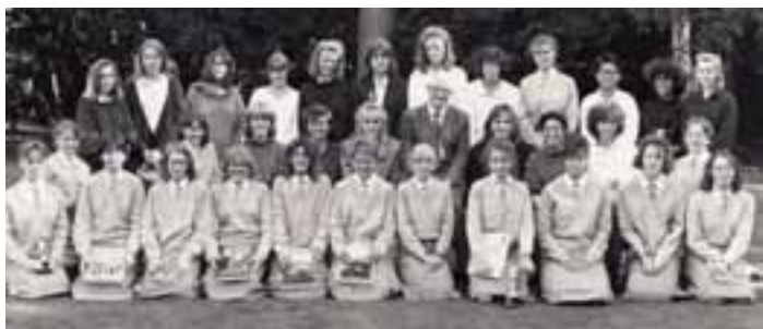
Speech Day winners 1988