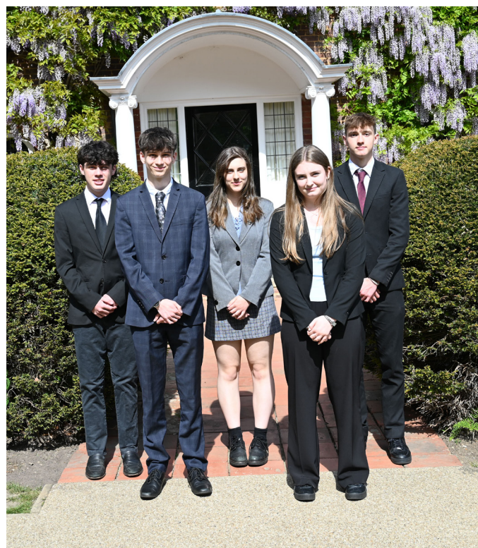
Senior Prefect Team 2025 - 26

These opportunities are valuable for developing your child's confidence and are good preparation for the leadership roles that are available in the Sixth Form.